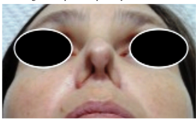
Figure 4. Patient with the external nasal valve incompetence

Therefore, it was found that the nasal valve incompetence is the most common functional rhinoplasty outcome, and it was diagnosed even in the group without any postoperative complications. The majority of patients' subjective complaints to nasal respiration after rhinoplasty correspond to objective results of respiratory nose function examination. Revision operations considerably improved nasal breathing as compared to primary results.