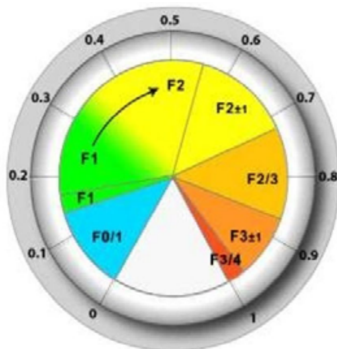
Fig.1. FibroTest and Fibrometer scales